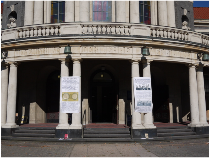
University of Hamburg, entrance area.