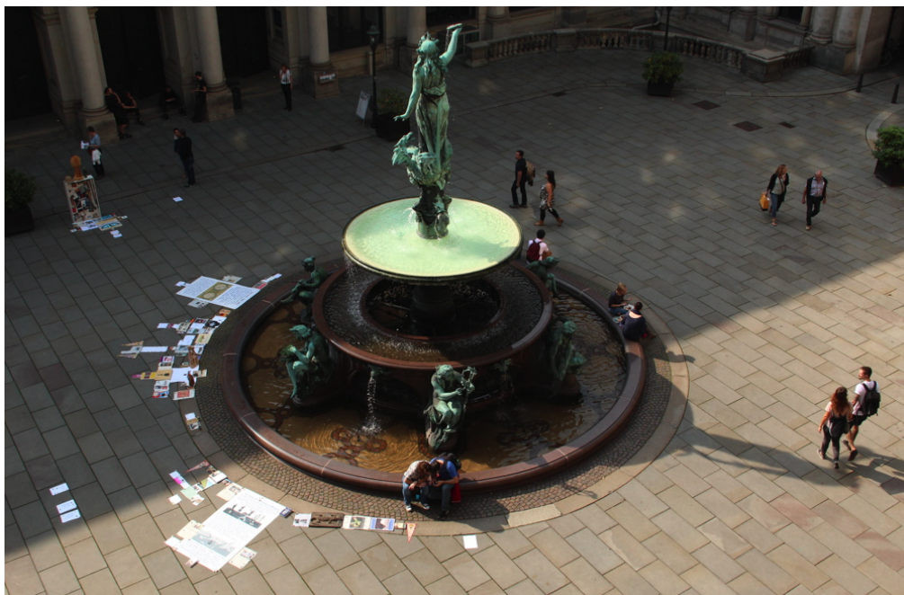
Inner Court of the Hamburg City Hall. September 15 th 2014.

The project "Inverted-Space" is organized jointly by the non-profit organization Kulturforum Sud-Nord and Stadtkuratorin Hamburg (curating public art of the city of Hamburg)