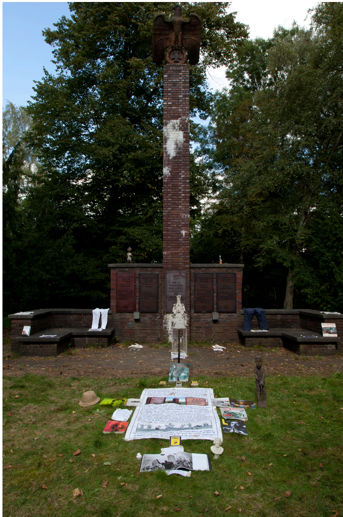
Jenfeld Hamburg "Tansania-Park" a nazi-era memorial for „lost colonies“.

He chose locations, which refer to the colonial history of Hamburg. Those were shown to him by the founding members of the association Arbeitskreis HAMBURG POSTKOLONIAL www.hamburg-postkolonial.de