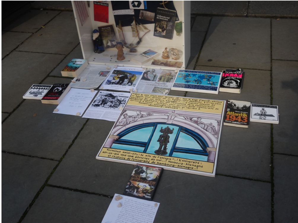
Inner Court of the Hamburg City Hall. September 15 th 2014. Detail.