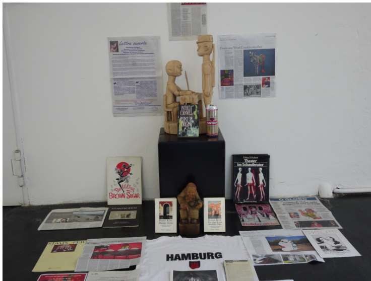
Producers Art Fair- Hamburg Harburg September 13 th 2015.