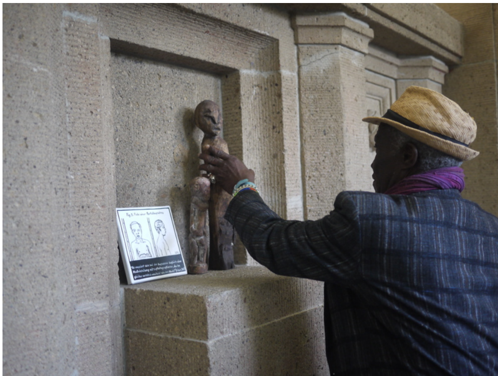
University of Hamburg, September 12 th . 2014. Lobby of the Main building, constructed 1911 as colonial institute.