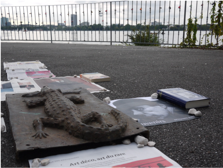
Hamburg- Alster Schwanenwik Area. September 14 th , 2014.