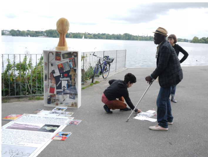
Hamburg- Alster Schwanenwik Area. September 14 th , 2014.